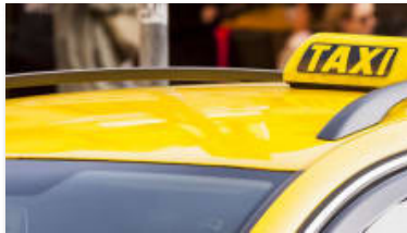
Ola In Talks To Acquire Public Transportation App Ridlr To Strengthen Its Tech Portfolio