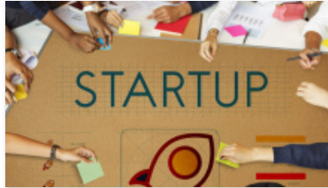
Mumbai Based 35North Ventures Launches $20.8 Mn Early Stage Fund