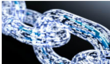
SBI To Create Blockchain-Based Exchange For Recovering NPA's